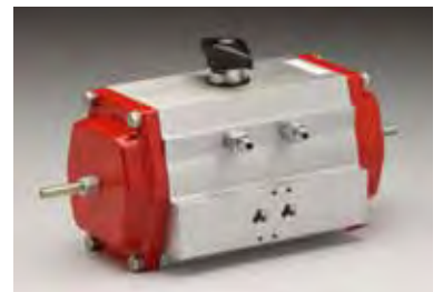
EXTENDED TRAVEL STOPS