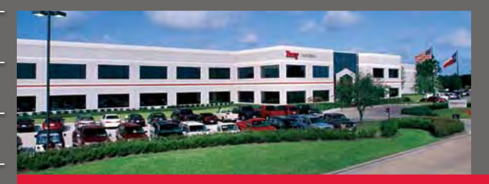
BRAY INTERNATIONAL, INC. WORLD HEADQUARTERS

RITEPRO - CANADA , Montréal +514.324.8900