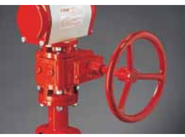
SERIES 5 - DECLUTCHABLE GEAR OPERATOR